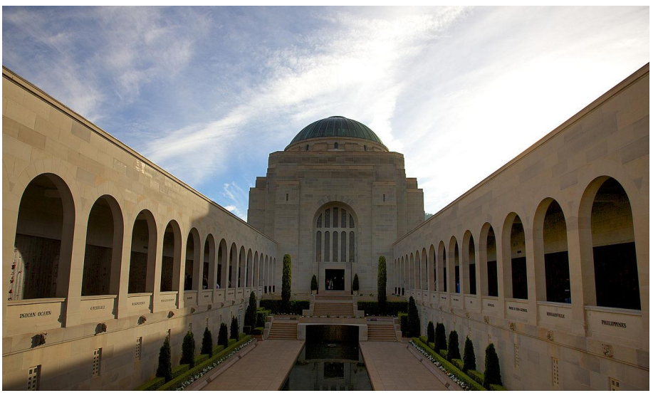
Commemorative Area of the Australian War Memorial

Second Lieutenant Alan Alexander Wilson-Walker, of No. 13 Reserve Squadron, Royal Flying Corps, is remembered on the Commemorative Roll Book, located in the Commemorative Area at the Australian War Memorial, Canberra. The Commemorative Roll records the names of those Australians who died during or as a result of wars in which Australians served, but who were not serving in the Australian Armed Forces and therefore not eligible for inclusion on the Roll of Honour.