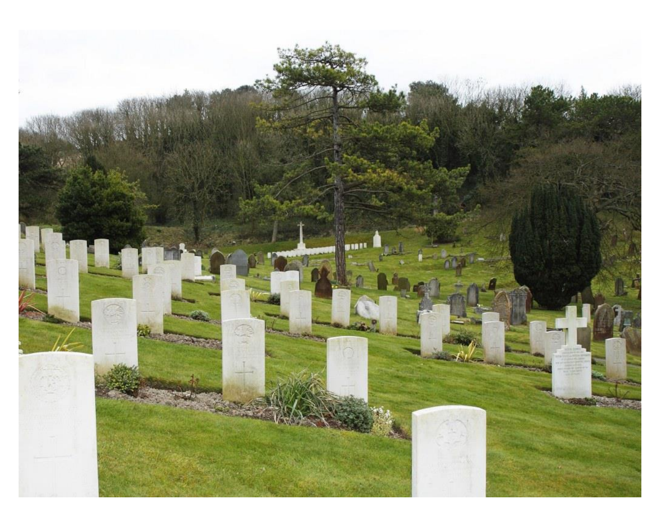
St. James Churchyard Cemetery, Dover