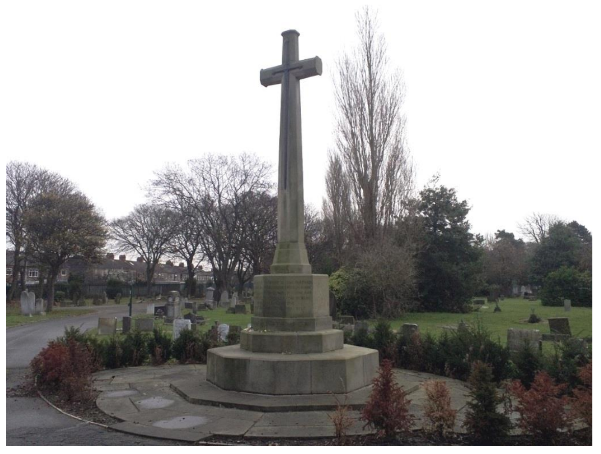
Cross of Sacrifice in Western Cemetery, Hull