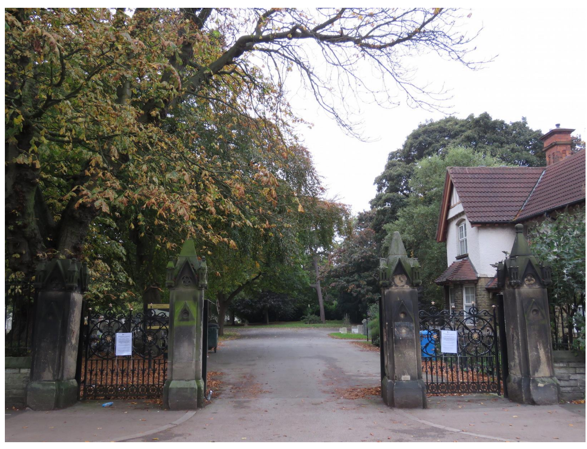
Western Cemetery Gates, Hull

Western Cemetery, Hull contains 493 Commonwealth War Graves – 393 from World War 1 & 100 from World War 2.