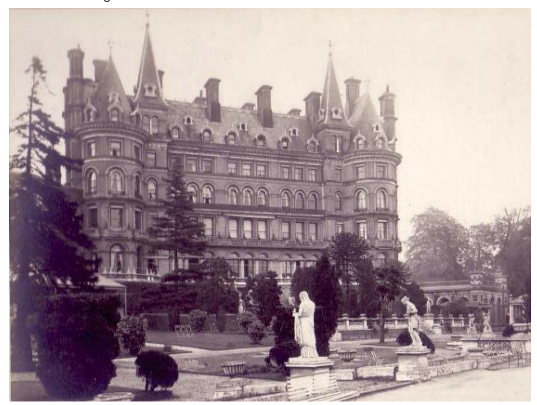
The Old Star and Garter Hotel

The Star and Garter Home in Richmond, London was a specialist hospital set up by the British Red Cross Society in 1916 for servicemen who had been severely disabled during the First World War. The building was formerly a hotel, and it provided facilities for long-term rehabilitation and care.