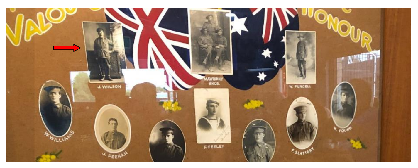
Neerim East Pictorial Honour Roll