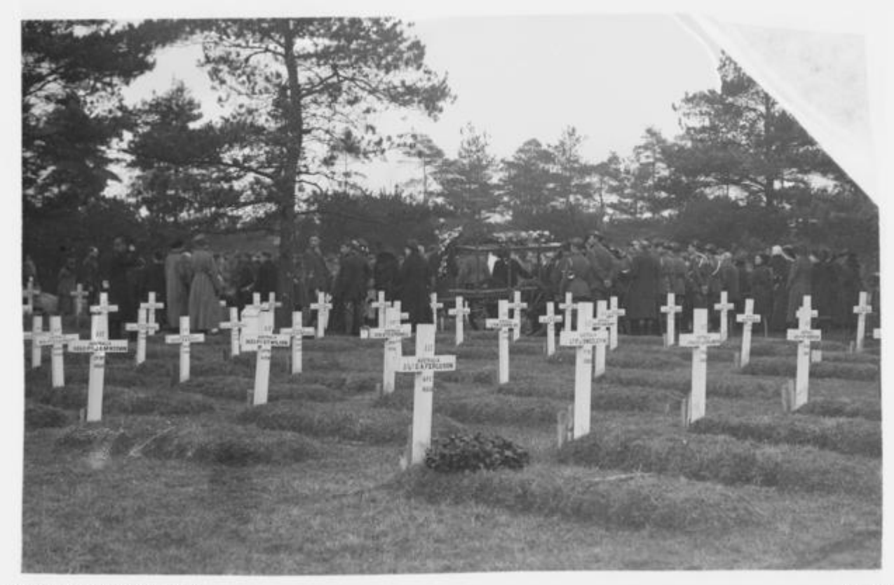
AUSTRALIAN WAR MEMORIAL D00185

There are 446 Australian War Graves in Brookwood Military Cemetery – 351 from World War 1 & 95 from World War 2.