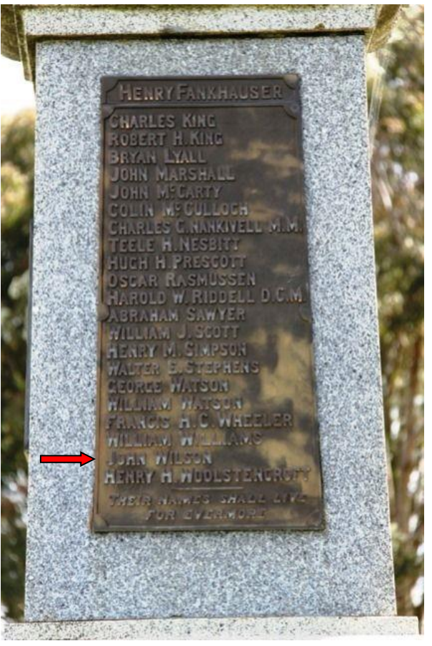
Neerim War Memorial