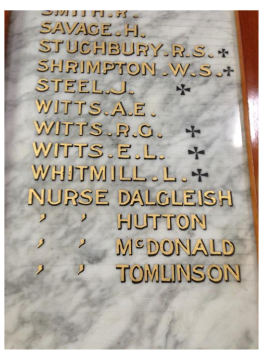
Roll of Honour Board in Presbyterian Church, Parkes