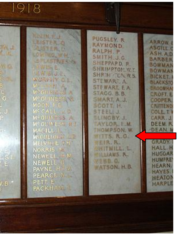
Parkes R.S.L. Roll of Honour