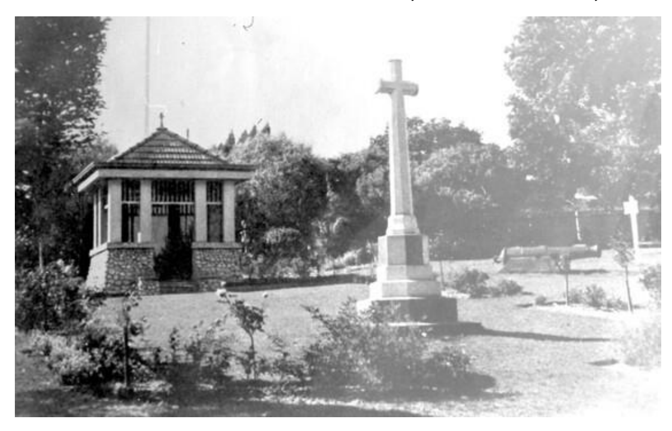
The Shrine (background) & Memorial Cross in Surrey Gardens (1933)