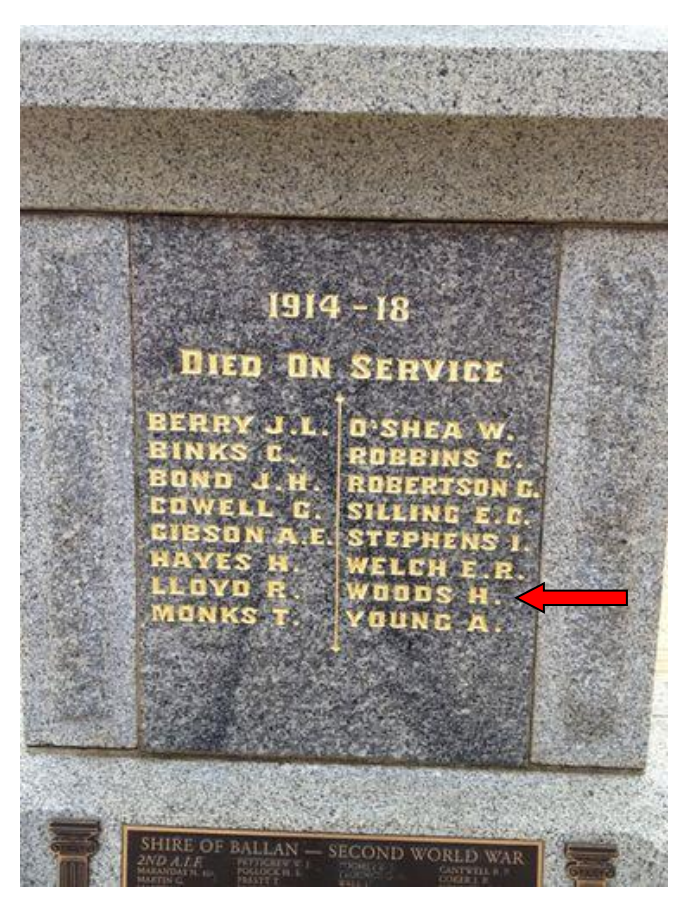
Ballan War Memorial