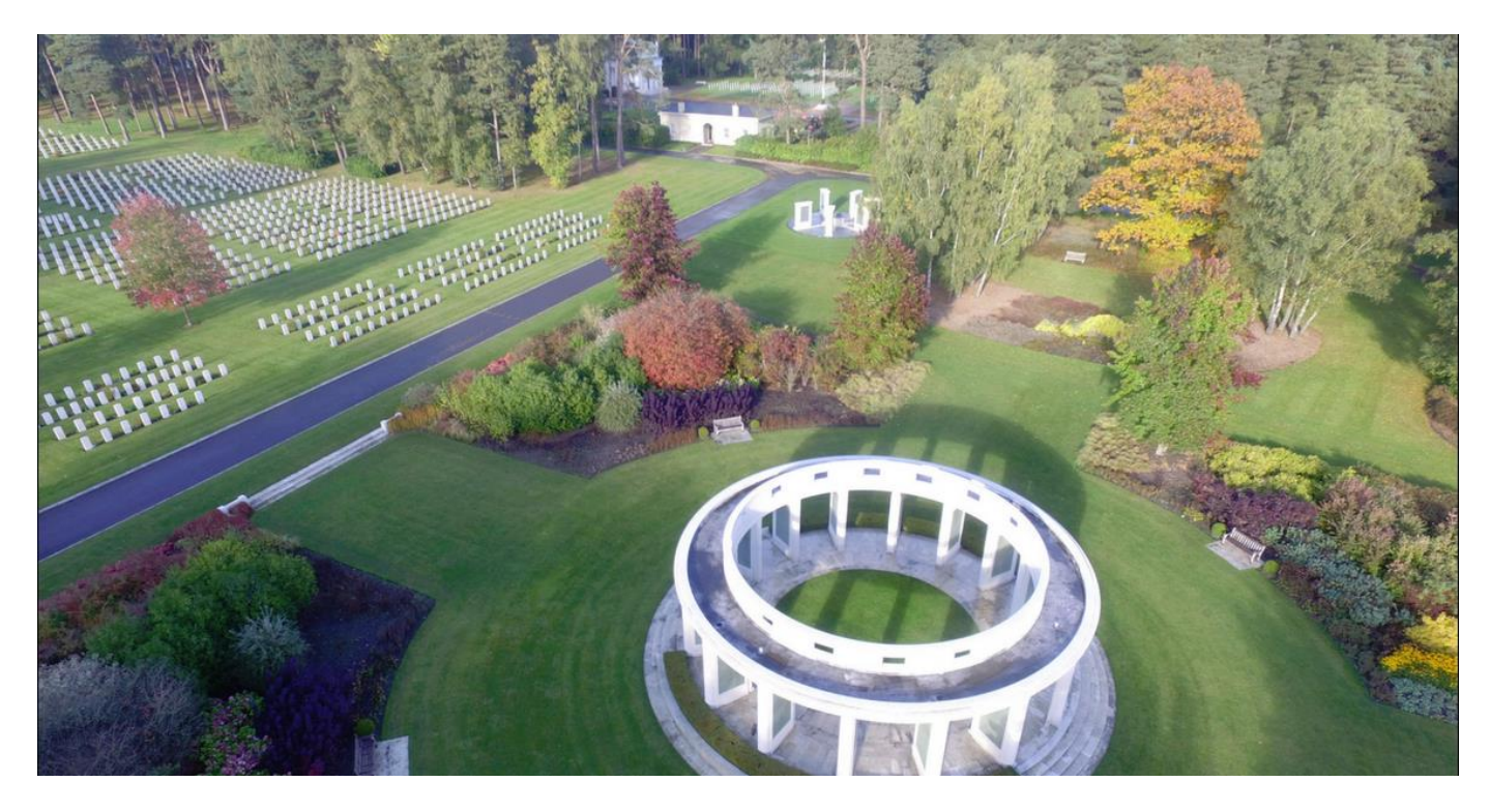
Brookwood Military Cemetery

There are 446 Australian War Graves in Brookwood Military Cemetery – 351 from World War 1 & 95 from World War 2.