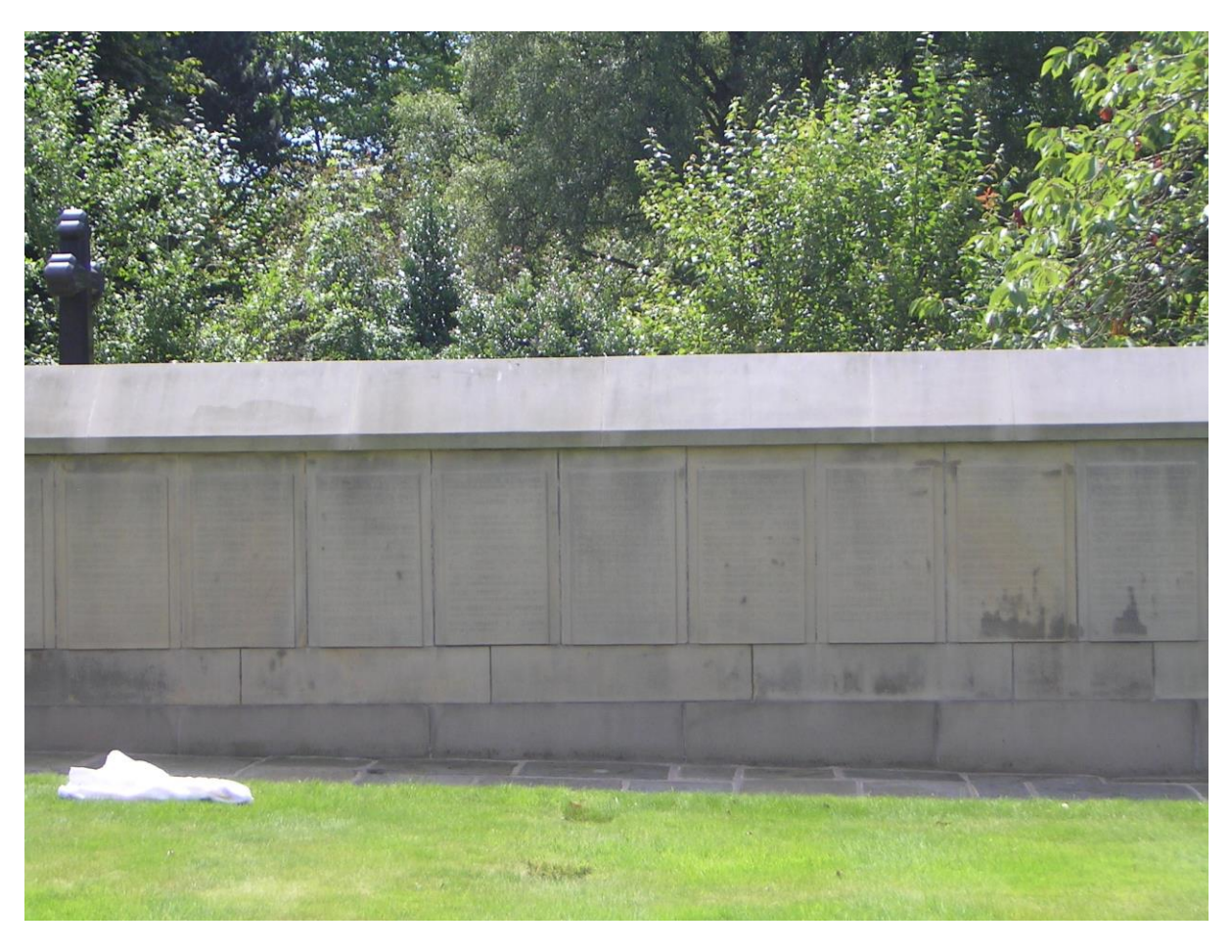
WW1 Screen Wall in Garden of Remembrance