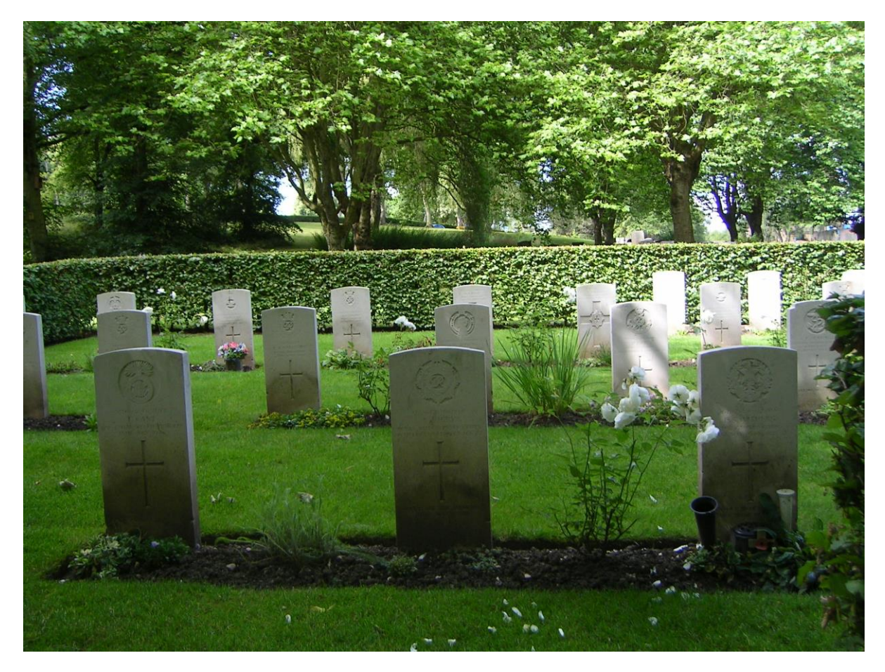
WW2 Garden of Remembrance