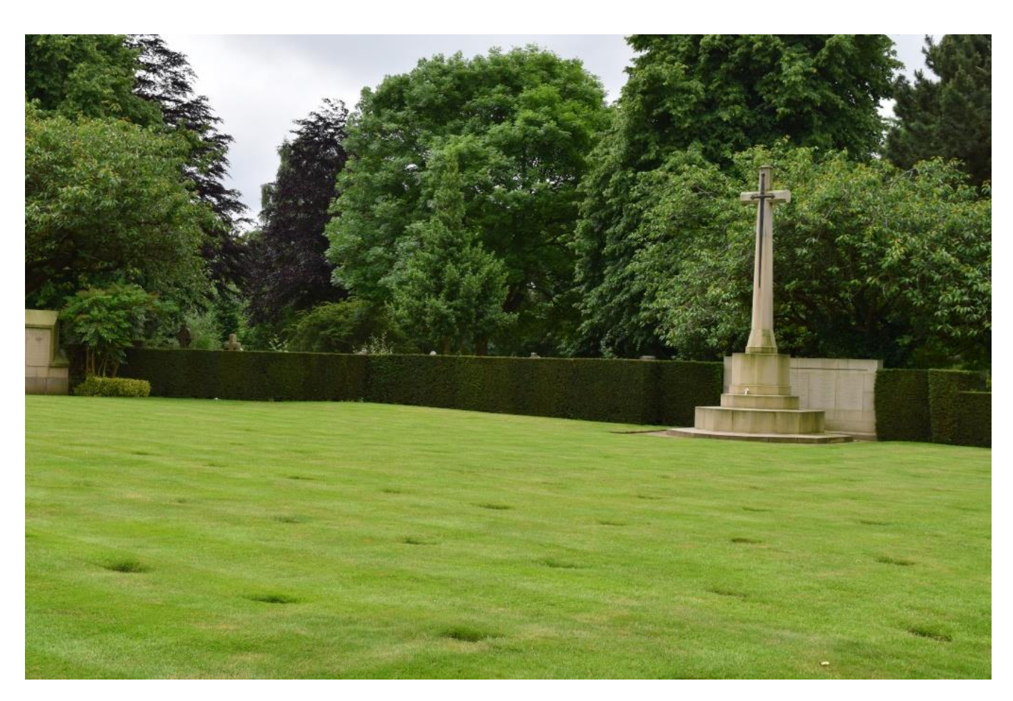
Lodge Hill Cemetery, Birmingham