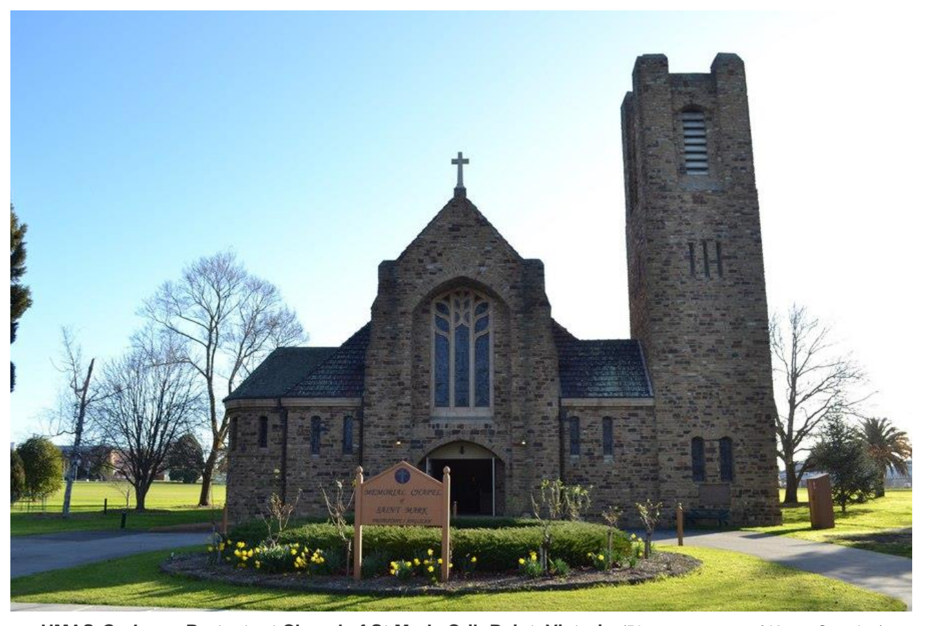
HMAS Cerberus Protestant Chapel of St Mark, Crib Point, Victoria