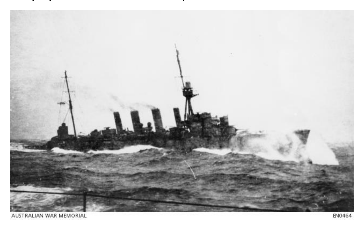
H.M.A.S. Sydney (January, 1918, Atlantic Ocean/North Sea)

H.M.A.S. Sydney arrived in Bermuda on 6<sup>th</sup> January, 1915 where she spent eighteen months uneventfully patrolling along the west coast of the Americas. On 9<sup>th</sup> September, 1916, the cruiser sailed for the United Kingdom, and after a brief refit in Greenock, joined the 5th Battle Squadron at Scapa Flow. On 15<sup>th</sup> November, Sydney was reassigned to the 2nd Light Cruiser Squadron at Greenock of which H.M.A.S. Australia was the flagship. For the remainder of the war H.M.A.S. Sydney 's service was confined to North Sea patrols.