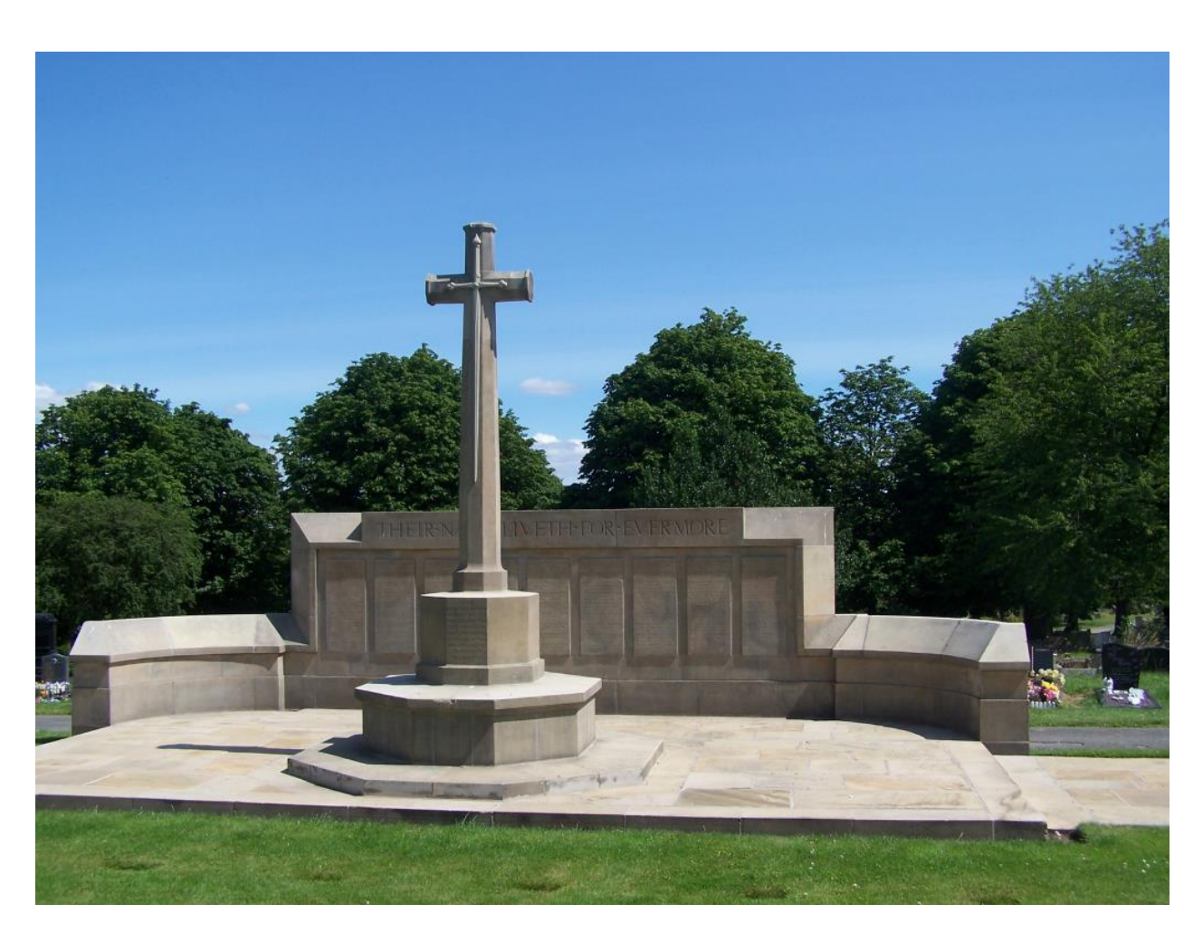
Cross of Sacrifice & Screen Wall