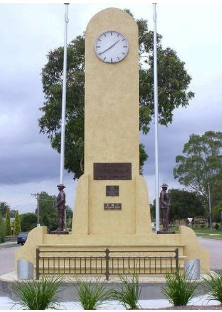
Orbost War Memorial / Memorial Clock Tower

The Orbost War Memorial / Memorial Clock Tower, located at Salisbury & Nicolson Streets, Orbost, Victoria does not have individual names.