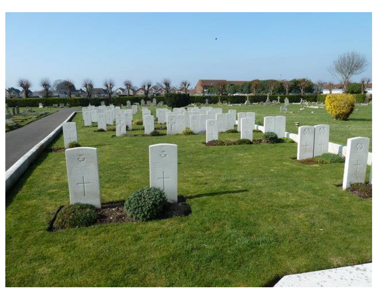
Some War Graves in Chichester Cemetery