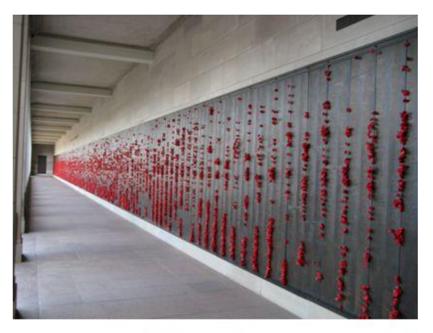
Roll Of Honour WW1 Australian War Memorial Canberra, Australia

Private E. Yates is commemorated on the Roll of Honour, located in the Hall of Memory Commemorative Area at the Australian War Memorial, Canberra, Australia on Panel 136.