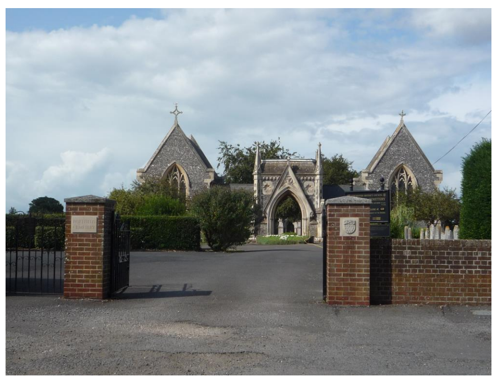
Chichester Cemetery

Of the 89 Commonwealth burials of the 1914-1918 war, the majority are in a War Graves Plot in Squares 121 and 126 bordering a path on the far right hand side of the cemetery. This was constructed by the City Corporation, who also erected the War Cross at the eastern end of the enclosed plot especially designed by Sir Reginald Blomfield and closely resembling the Commission's own Cross of Sacrifice. The names of the 1914-1918 war dead in the cemetery are engraved on the base of the Cross. There are also 75 Commonwealth burials of the 1939-1945 war here, mainly in two adjoining Church of England dedicated Squares, Nos. 115 and 159, in the south-western portion of the cemetery enclosed by a hedgerow on three sides, on the fourth side a wall bearing the inscription 1939-1945 THE MEN AND WOMEN BURIED IN THIS PLOT DIED IN THE SERVICE OF THEIR COUNTRY THEIR NAME LIVETH FOR EVERMORE. In the northern section a further Square, No. 42, is dedicated to Roman Catholic burials, there is a metal plaque bearing a similar inscription. There are also 7 non-Commonwealth war burials and 4 non World War burials in the care of C.W.G.C. within the cemetery. (Information from CWGC)