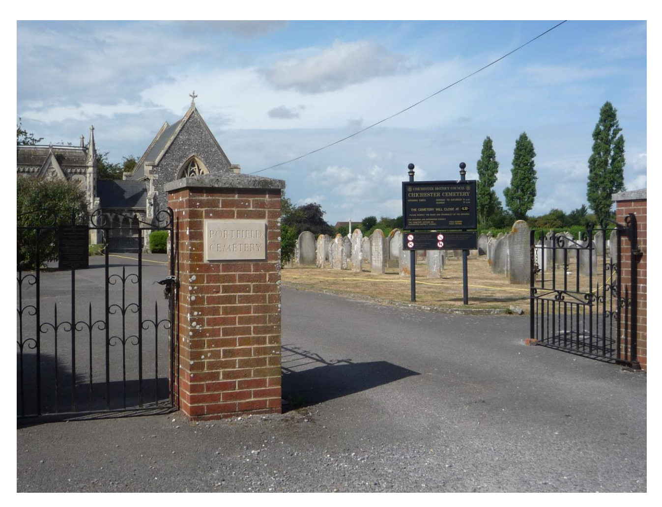
Chichester Cemetery