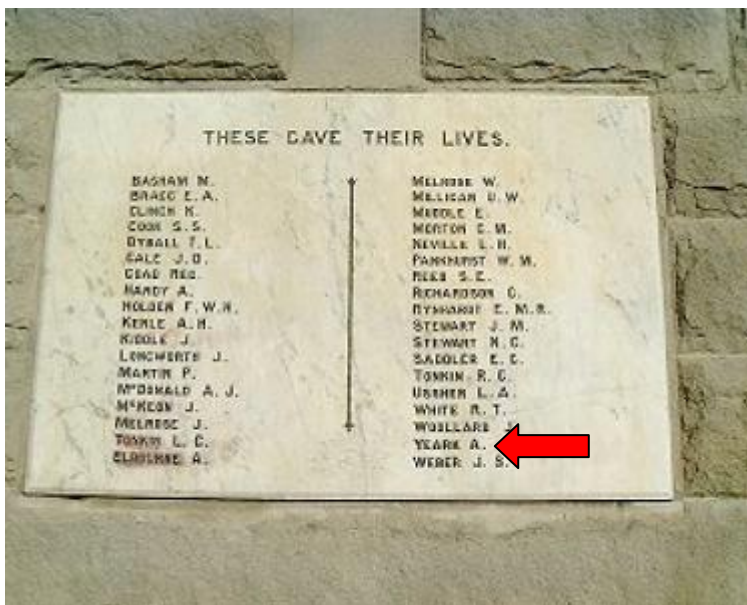
Taree World War 1 Memorial