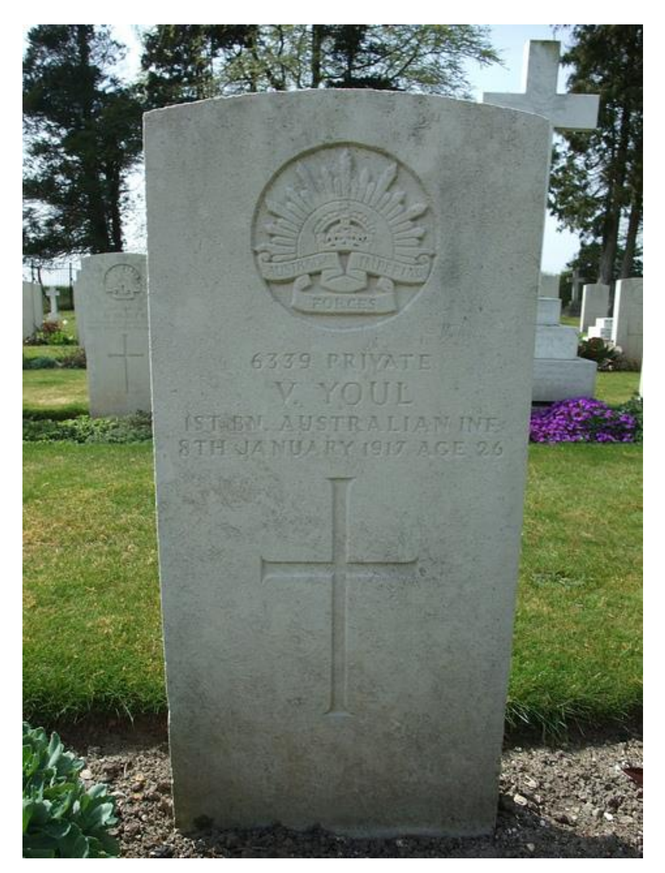
Photo of Pte V. Youl's Headstone at Durrington Cemetery, Wiltshire.