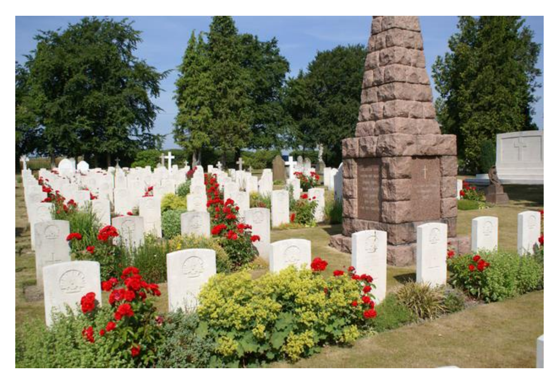
Durrington Cemetery, Wiltshire

Private V. Youl is also remembered on the Red Granite Obelisk Memorial to Men of 1<sup>st</sup> Training Battalion A.I.F. which is located in Durrington Cemetery, Wiltshire.