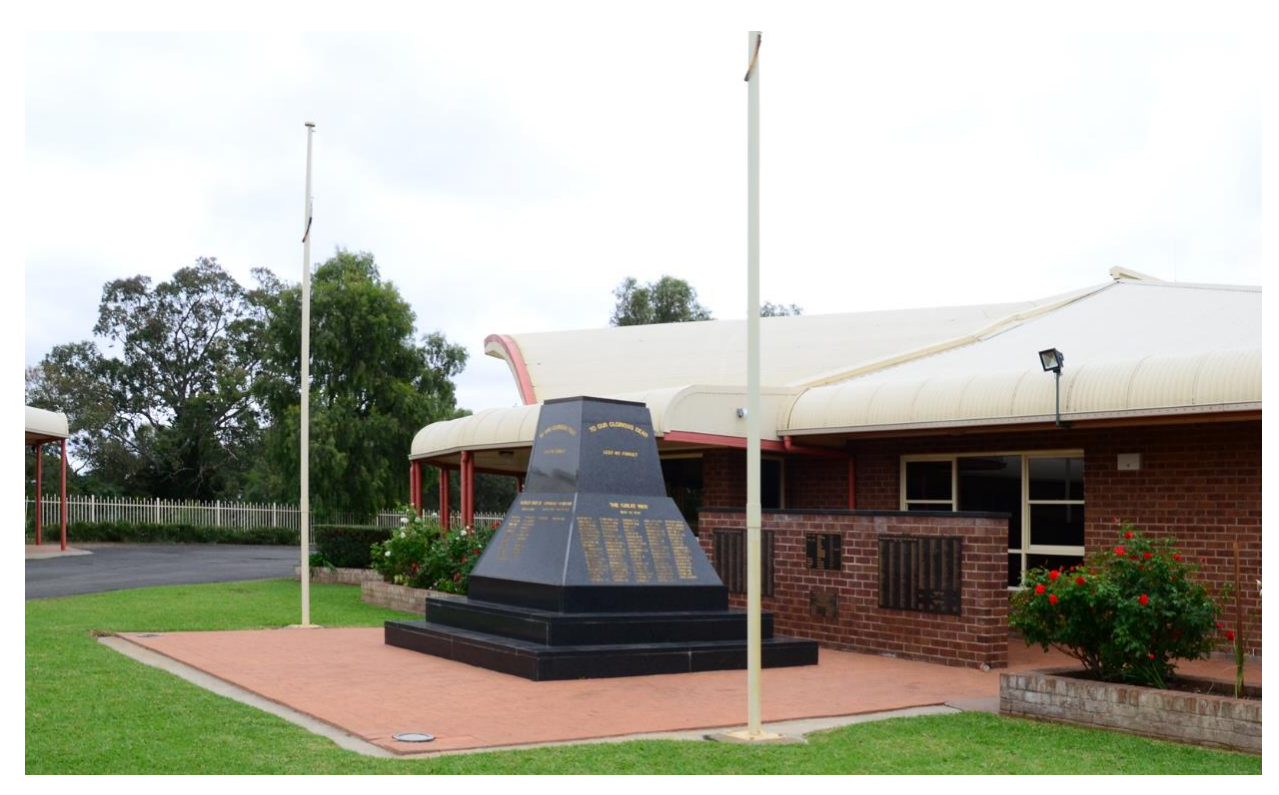
Coonamble War Memorial