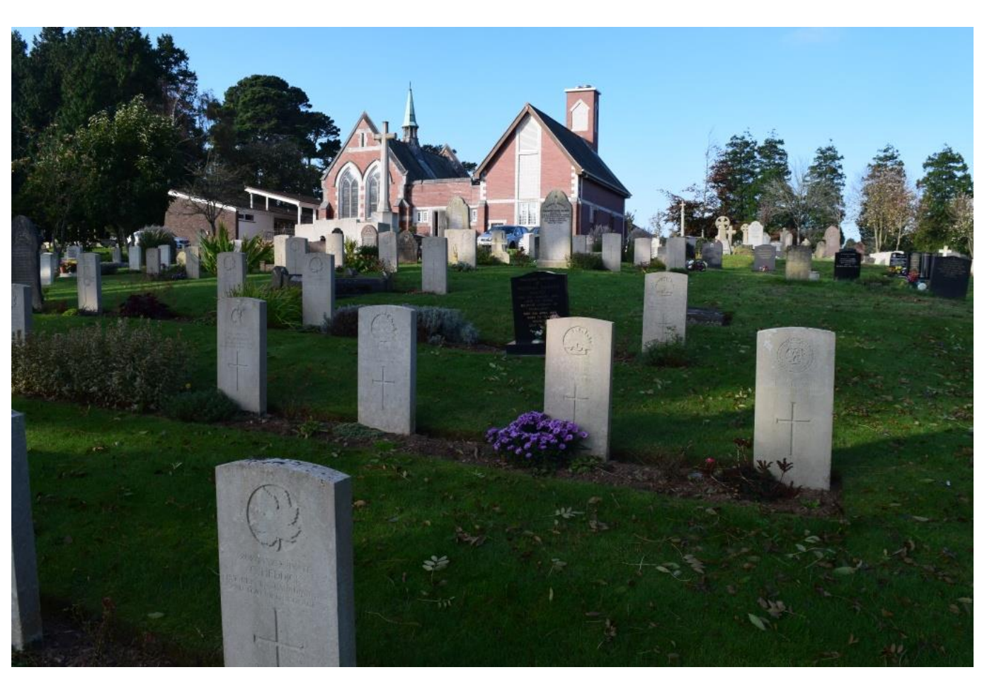
War Graves in Efford Cemetery, Plymouth