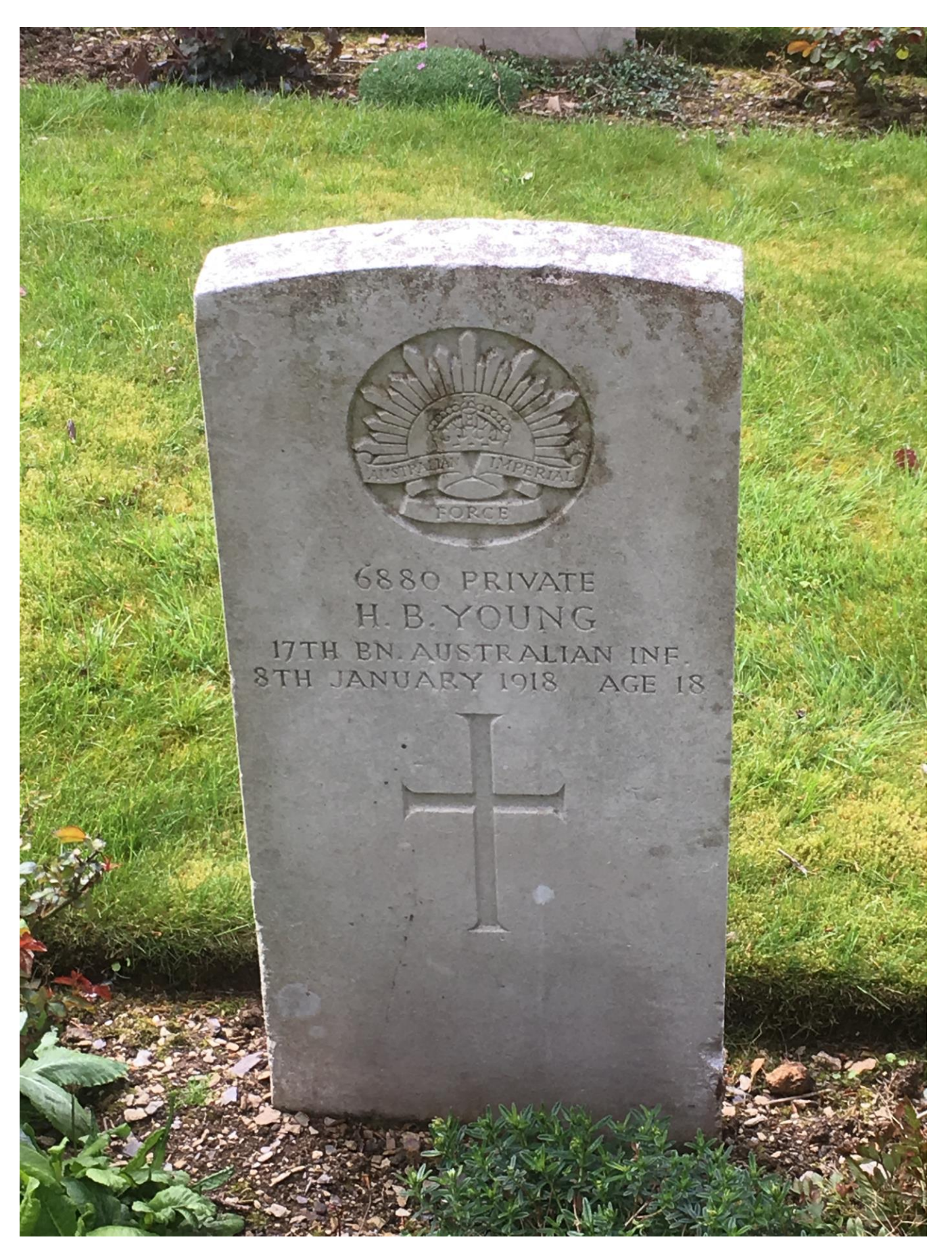
Photo of Private H. B. Young's Commonwealth War Graves Commission Headstone in Efford Cemetery, Plymouth, Devon, England.