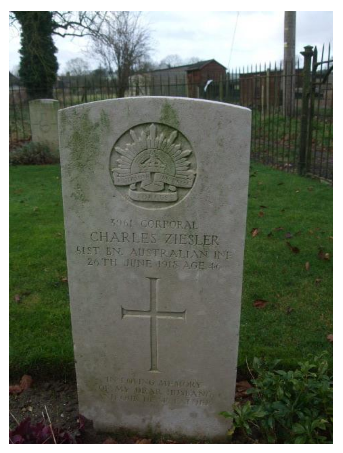
Photo of Corporal Charles Ziesler's Commonwealth War Graves Commission Headstone in St. Mary's New Churchyard, Codford, Wiltshire, England. Also known as Codford Anzac War Graves Cemetery, Wiltshire.